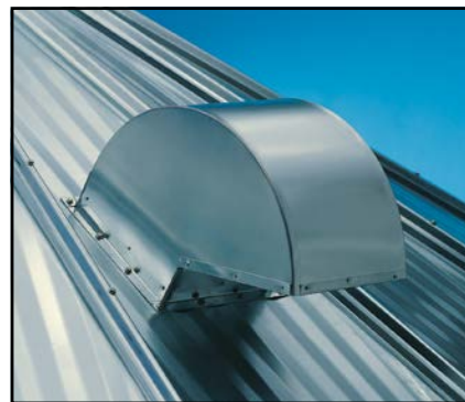
Gravity Roof Ventilators are available in both elbow and round mushroom styles to help ensure free air movement throughout the bin.