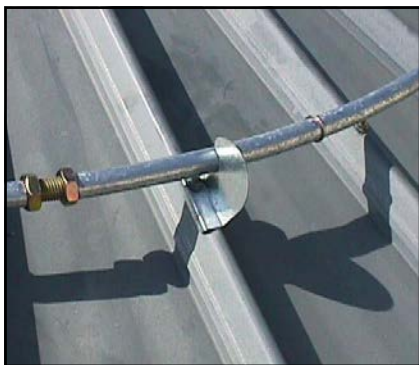
Roof Compression Rings provide additional structural support and another level of safety for those working on top of the bin.