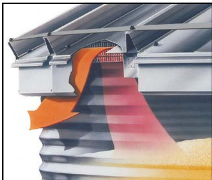
Unique Eave-Vent System raises the roof off the sidewalls to create ample ventilation around the entire circumference of the bin. The result is more air circulation while eliminating roof cuts, all at a lower cost than rooftop ventilation options.