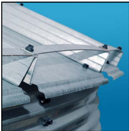
"High Rise" 3-Step Roof Rib s paired with the innovative Eave Tension Straps provide unsurpassed durability and the highest peak load capacities available.