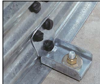
Bin Anchor System helps create a strong, weather-tight connection to the foundation, protecting your investment from winds up to 90 mph (145 kph).