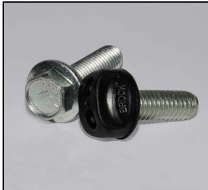
High Strength Bin Assembly Bolts are a Grade 8, with JS1000™ coating for superior weather- and corrosion-resistance. The JS1000 trademark is not owned or licensed by CTB.

For growers storing their own grain, Brock's grain storage bins continue to be the first choice for safeguarding their crops. Brock Solid delivers. Always has, always will.