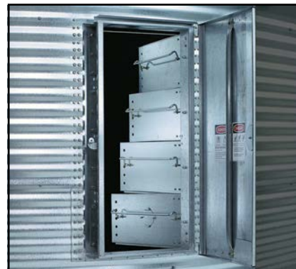
LATCH-LOCK® Walk-Through Bin Entry Doors offer simple yet safe access, with a one-piece outer door and four interlocking inner panels that open in sequence from top to bottom with a lift of a latch.