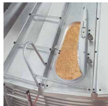
Large "obround" manhole for easy entry and exit.