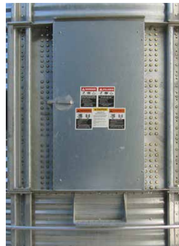
Brock's LATCH-LOCK® Walk-Through Entrance Door for Stiffened Bins.