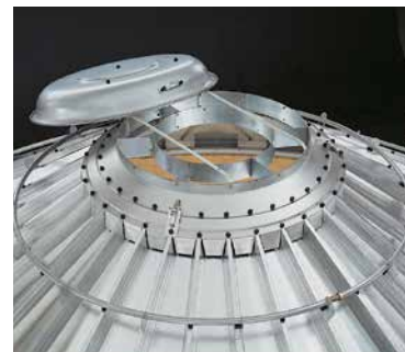
Giant 39-inch (991-mm) fill hole.