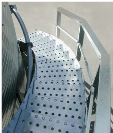
The wide, sturdy steps of BROCK SHUR-STEP® Stairs feature raised perforations forming a non-skid surface, are fabricated from galvanized steel for long-lasting service and designed to meet or exceed relevant OSHA standards when installed properly.

BROCK SHUR-STEP Bin Stairs – another reason more people are making their next bin Brock!