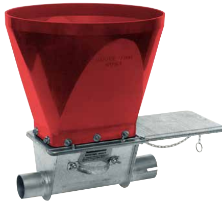
BROCK's Straight-Out Boot Transition