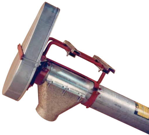
Six-inch (152-mm) Auger Drive Motor Mount

Whatever your rigid auger needs, there's a broad range of accessories available to help you design your conveying system to your exact specifications.