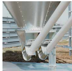
C - Boot with two auger systems servicing two buildings (Model 125 FLEX-AUGER® shown.)