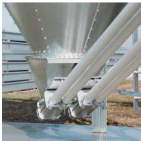
A - Boot with four auger systems servicing one building (Model 90 FLEX-AUGER® shown.)