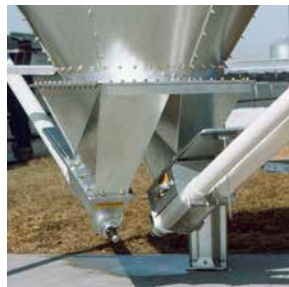
B - Boot with three auger systems servicing two buildings (Model 75 FLEX-AUGER® shown.)