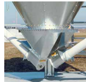
C - Boot with two auger systems servicing two buildings (Model 125 FLEX-AUGER® shown.)