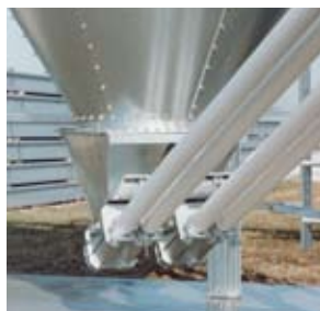
A - Boot with four auger systems servicing one building (Model 90 FLEX-AUGER® shown.)