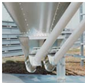
C - Boot with two auger systems servicing two buildings (Model 125 FLEX-AUGER® shown.)