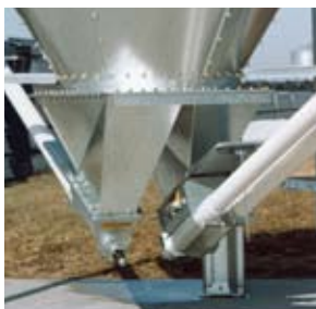
B - Boot with three auger systems servicing two buildings (Model 75 FLEX-AUGER® shown.)