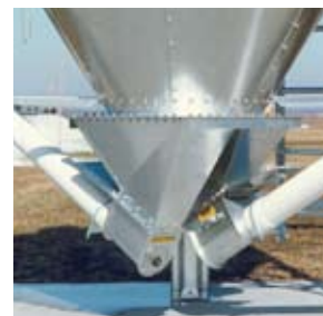
C - Boot with two auger systems servicing two buildings (Model 125 FLEX-AUGER® shown.)