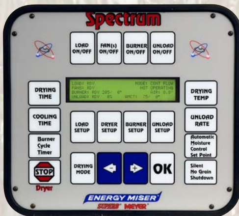
SPECTRUM® Dryer Controller

The SPECTRUM® Controller features a four-line back-lit LCD display. Display is easy to read in bright sunlight as well as at night.