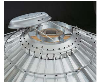
Giant 39-inch (991-mm) fill hole.