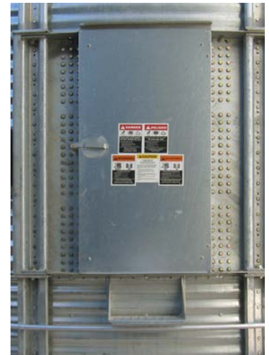
Brock's LATCH-LOCK® Walk-Through Entrance Door for Stiffened Bins.