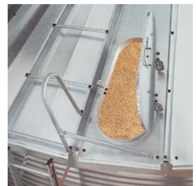
Large "obround" manhole for easy entry and exit.