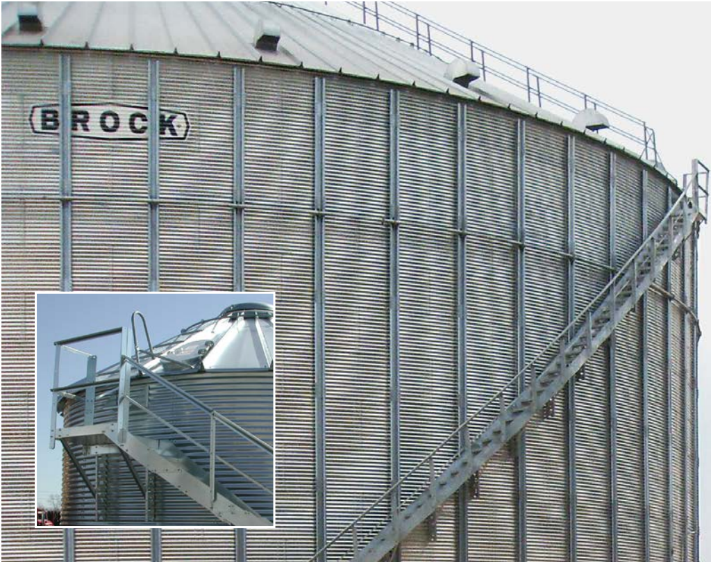
Stairway can be used with stiffened or unstiffened bins, or bins with wind rings.