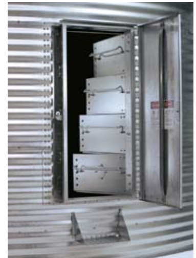
Brock's LATCH-LOCK® Walk-Through Bin Door.