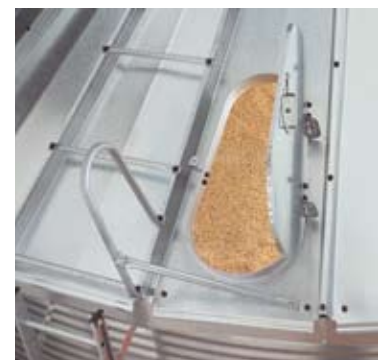
Large "obround" manhole for easy entry and exit.