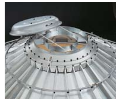
Giant 40-inch (1016-mm) fill hole.