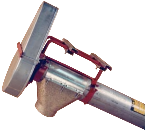
Six-inch (152-mm) Auger Drive Motor Mount

Whatever your rigid auger needs, there's a broad range of accessories available to help you design your conveying system to your exact specifications.