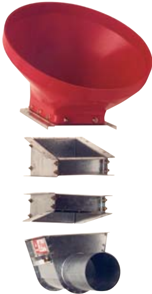
Galvanized Steel Transitions

Need more boot incline than that provided by Brock's 30-degree boot transitions? Brock offers 7 1/2-degree and 15-degree galvanized steel transitions for attaching to the bottom of both our 16-inch (shown at left) and 25-inch (shown below) boot transitions.