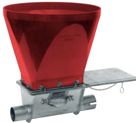
BROCK's Straight-Out Boot Transition